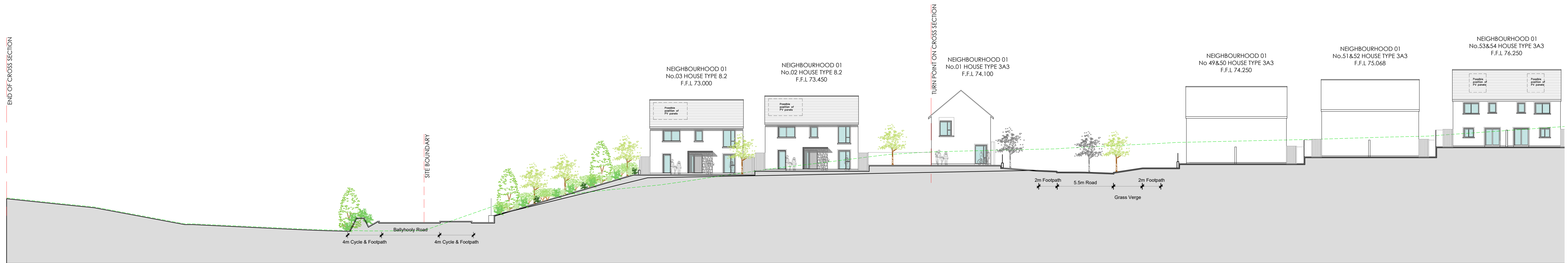
Section 7-7 Part 1 of 2 SCALE 1:200 @ A0