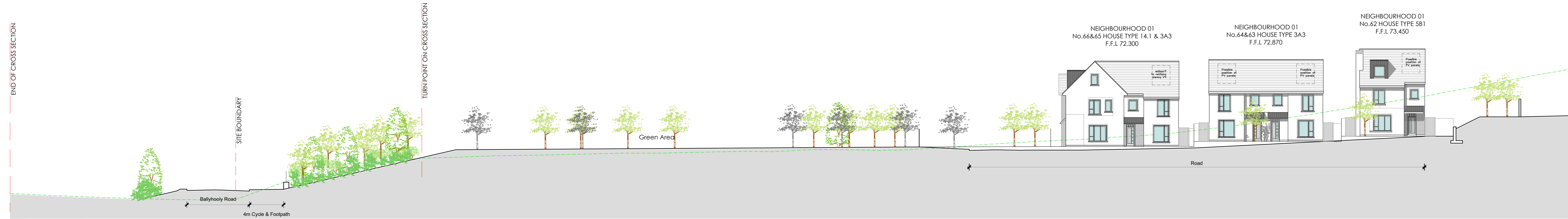
Section 6-6 - Part 1 of 2 SCALE 1:200 @ A0